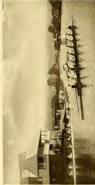
THE CREWS AT ITHACA